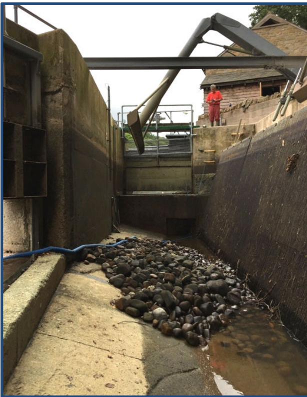
One of the inlet scree “wiper blades” and Stone coming in during high river flows.